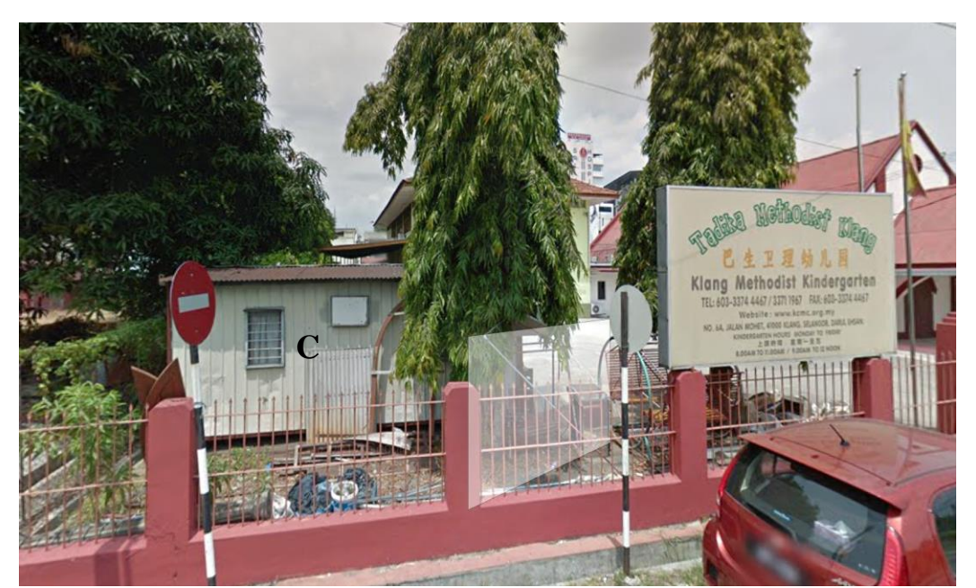
A: Administration office