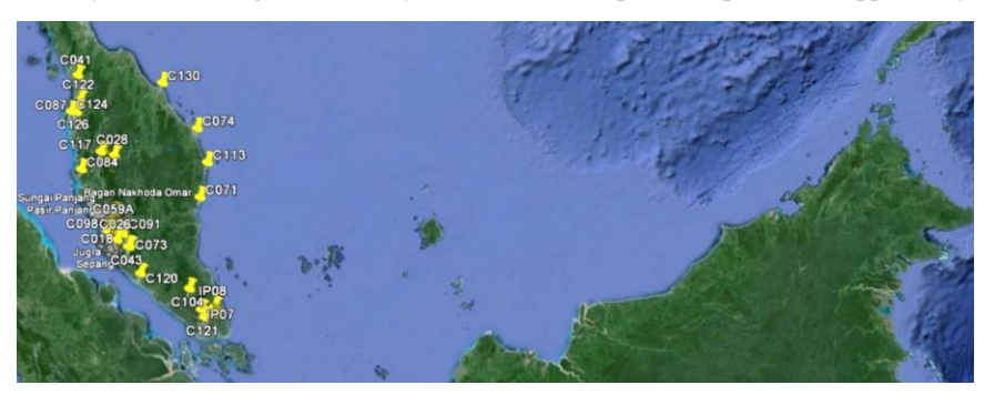
Figure 1: 133 learning centres located in the capital of Malaysia, Kuala Lumpur and 10 other states

Among the refugees and asylum seekers in Malaysia, 40,470 are under the age of 18. However, only 30 percent are enrolled in community learning centres and the enrolment rate in primary and secondary education were reported at 44 percent and 16 percent respectively (UNHCR, 2017c). Given that Malaysia is a non-signatory to the 1951 Refugee Convention, refugee children in the country are denied access to the national education system. However, the government has welcomed initiatives by the private sector, NGOs and individuals in providing these children with an education (UNICEF, 2015). Thus, refugee children can only obtain education via an informal parallel system of more than 130 community-based learning centres,s established either by the local refugee community, local NGOs, or a partnership of both, supported by UNHCR.